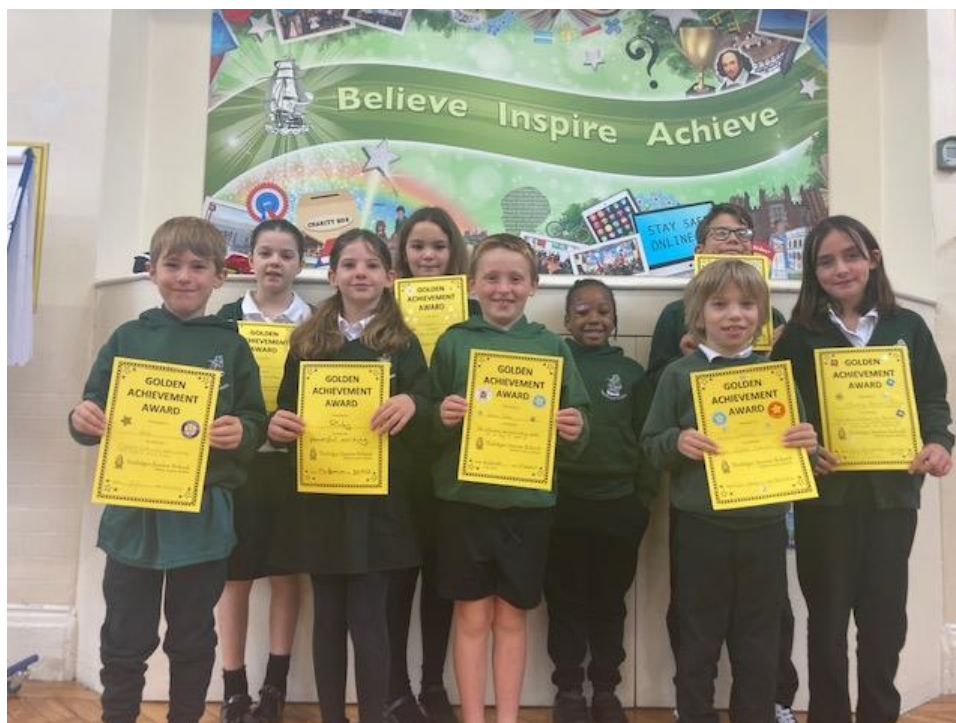
For Infant Golden Achievement photos please log on to J2E